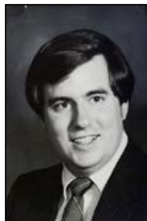
Mark Hofmann—Bomber or Victim?

Mark Hofmann, who investigators continue to call their “prime suspect” in the bombing murders of two people last month, has passed a lie detector test indicating he is telling the truth when he says he did not plant the bombs, his defense attorney said Tuesday.