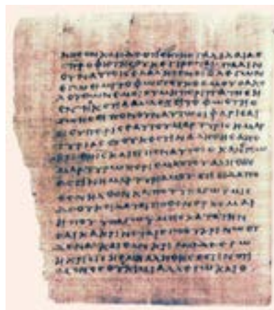
New Testament Manuscript About 200 AD

One church scholar said he was forced to resign his job after writing a research paper. . . .