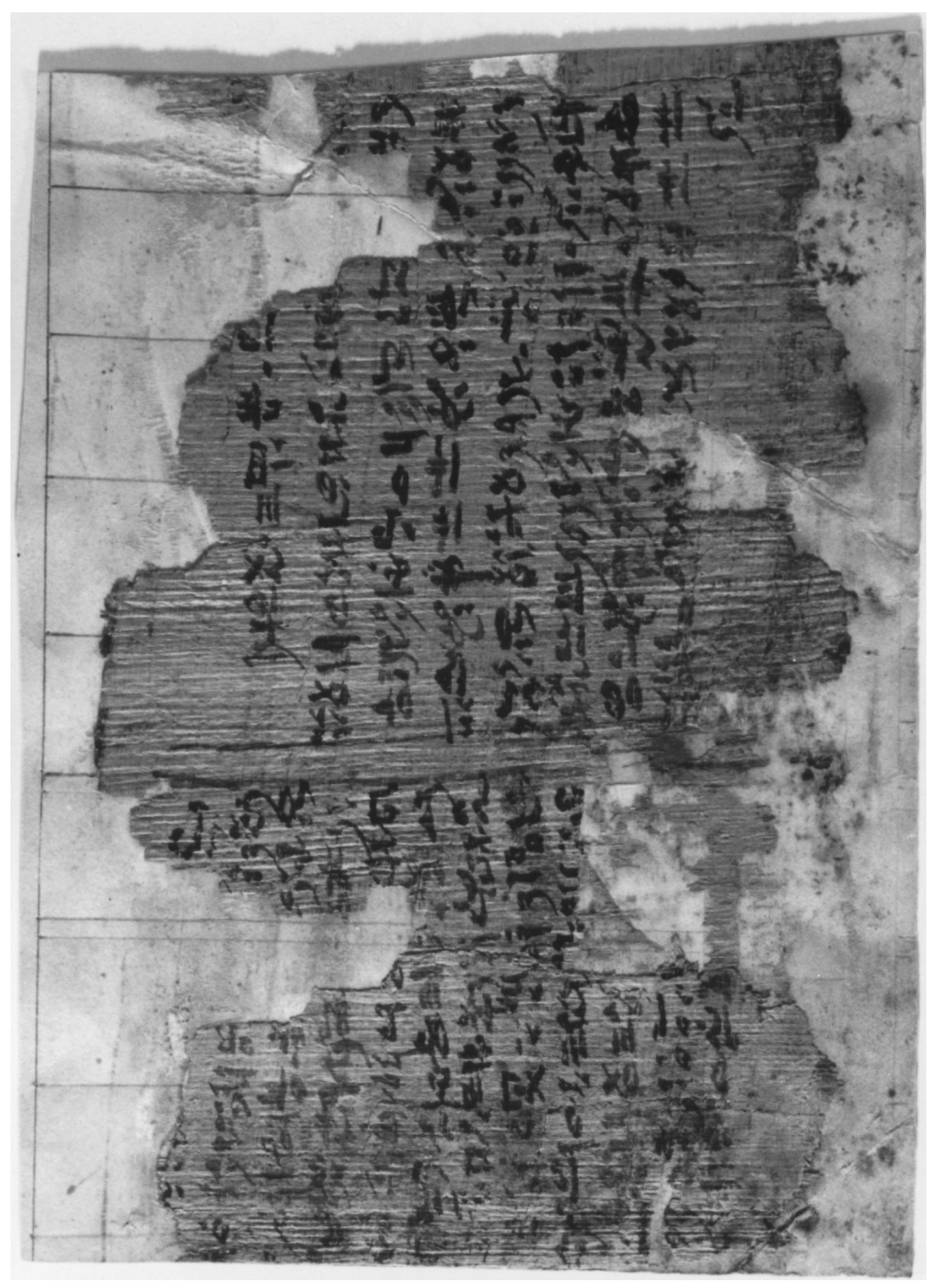
Fig. 2.—Papyrus Joseph Smith (= Cols. II–III).