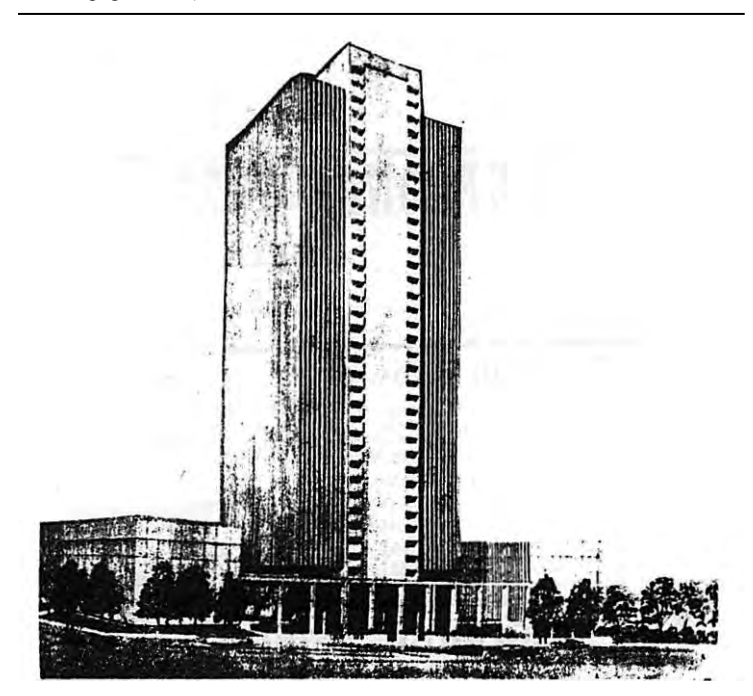
NEW CHURCH ADMINISTRATION OFFICE. This is the front view from North Temple street in foreground of proposed 36-story office building for Church of Jesus Christ of Latter-day Saints, announced Friday. New mission headquarters and home would be located in right wing.

But even true believers might be surprised by the latest investment, announced last week in New York. The Mormon church purchased (for $1.3 million) a plot of land in the heart of Mid-town Manhattan as a site for a "30- or 40-story" skyscraper to include a chapel, auditorium, library, church administrative offices, along with offices or apartments for public rental. The building, scheduled to open in 1965, . . . ( Newsweek , January 22, 1962, pages 67-68)